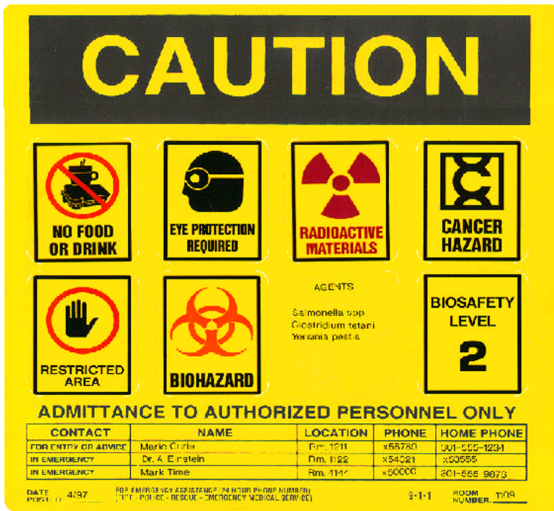
Sample completed sign